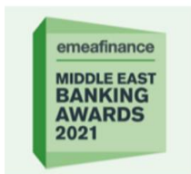
Most innovative Bank Middle East