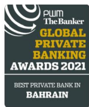
Best Private Bank Bahrain 2014 - 2021