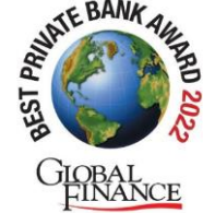
Bahrain 2017 – 2020, 2022