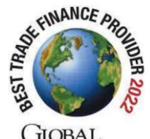
Best Bank for Export Finance Global