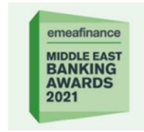
Best Local Bank in Bahrain 2008 – 2021